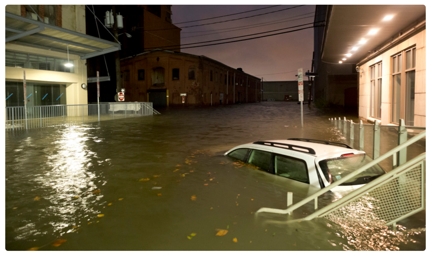
Warning time may be limited, but an effective flood emergency response plan can help prevent your organization from experiencing unnecessary property damage and business interruption.