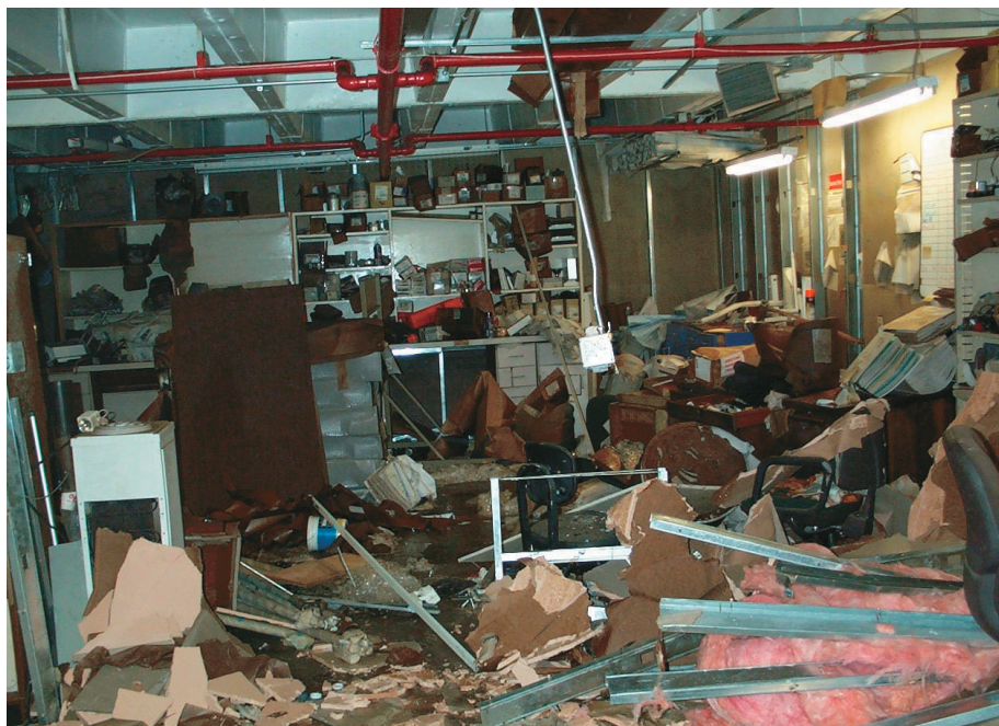
This maintenance office, located in a below-grade area, was completely submerged. Valuable maintenance records, service agreements and other articles were lost.

A spice manufacturing facility experienced two almost identical flood losses one year apart. The second time around, storage of finished products had been relocated to a height above the previous flood levels. Also, employees took their laptop computers home and were able to conduct vital business transactions from there. These steps resulted in the second flood loss being less than 50% of the first, a savings of US$1 million.